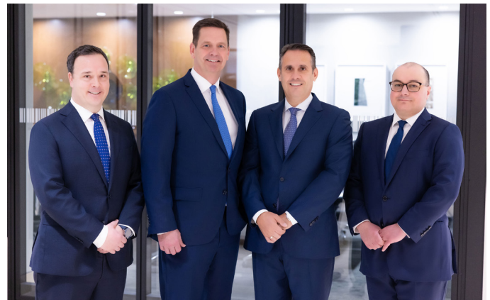
MK Total Wealth Management Group TD Wealth Private Investment Advice